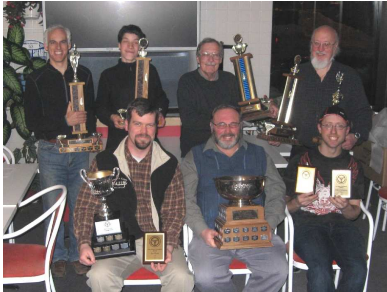
PMSC Awards Night – Jan. 26, 2011