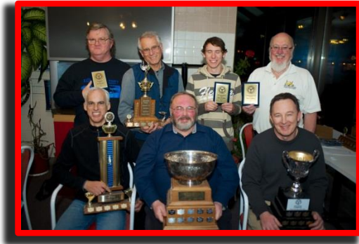
Some of the Winners in 2012

To let club organizers know, contact the club at pmsclubinfo@gmail.com or 705-745-0685 or 705-768-0685.