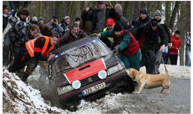
(From the WRC Website)