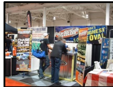
Peterborough Speedway Booth