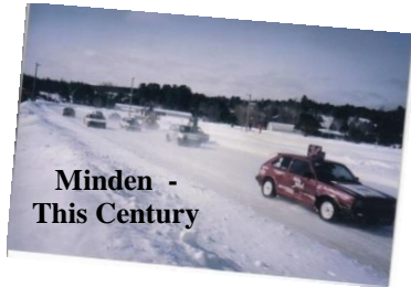
Minden - This Century