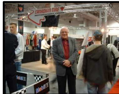
Norris MacDonald Toronto Star "Wheels"